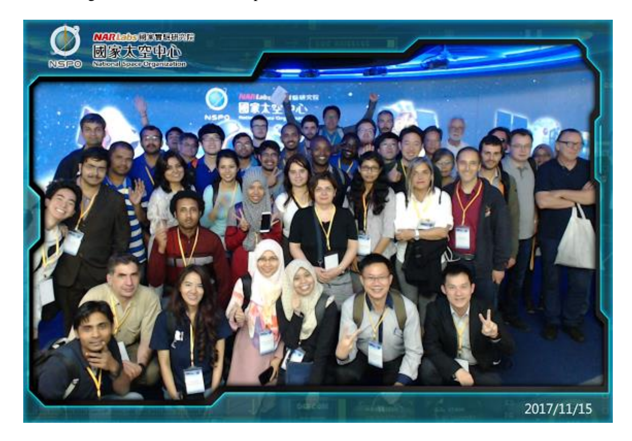
Workshop attendees enjoying excursion to the National Space Organization (NSPO)